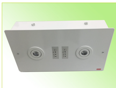
"CRYSTALITE" Cat. CE-DPC-2X3W-DN